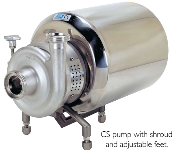
CS pump with shroud and adjustable feet.